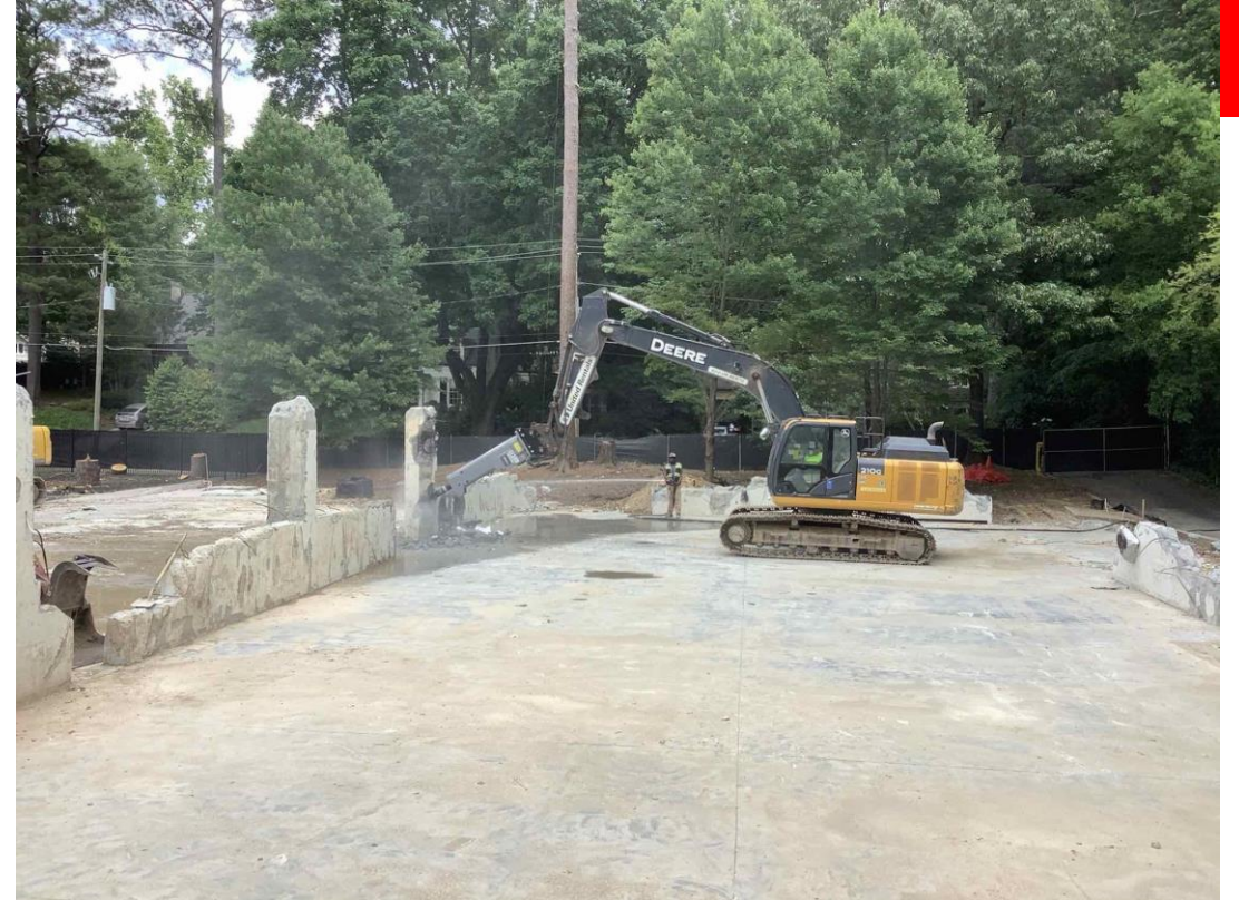
Concrete demolition at existing gym building