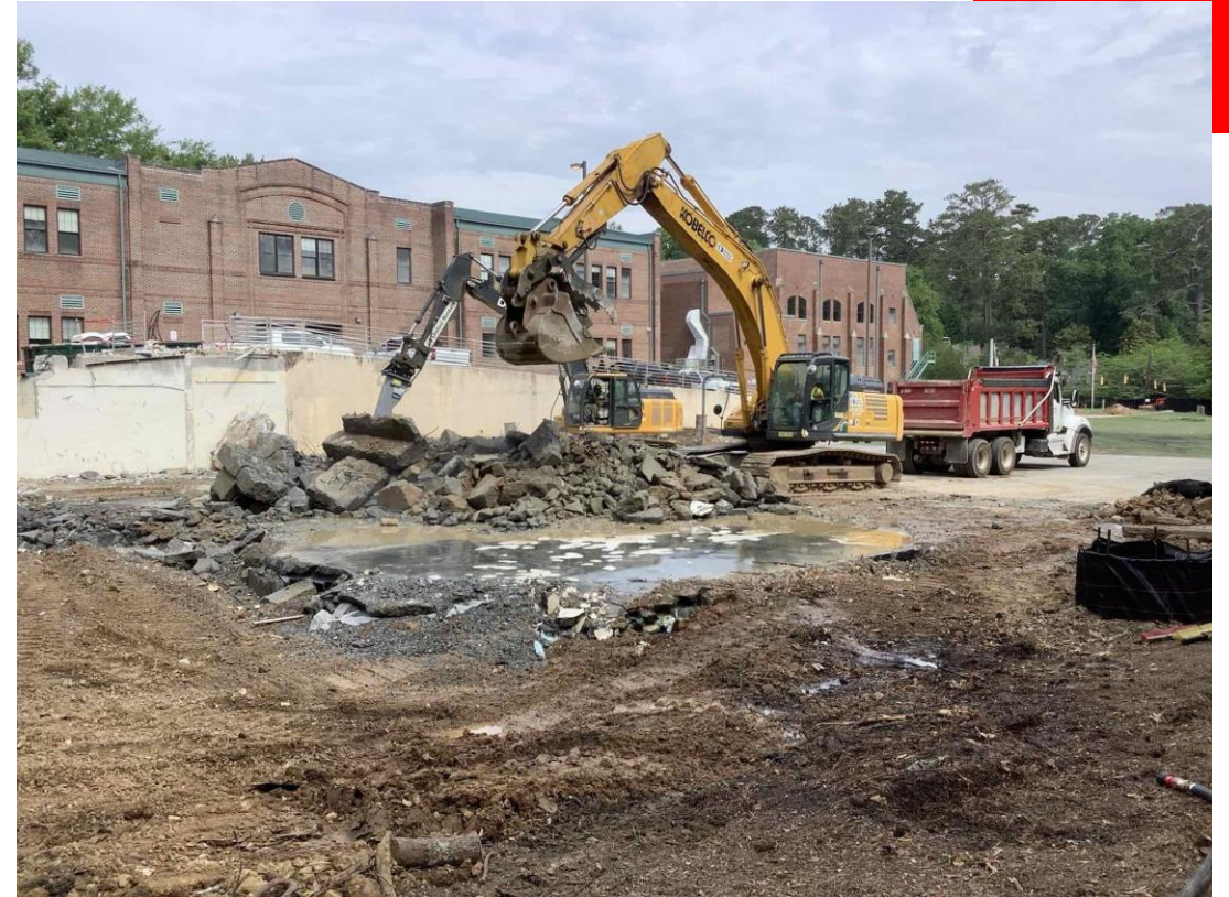
Existing gym concrete slab demolition