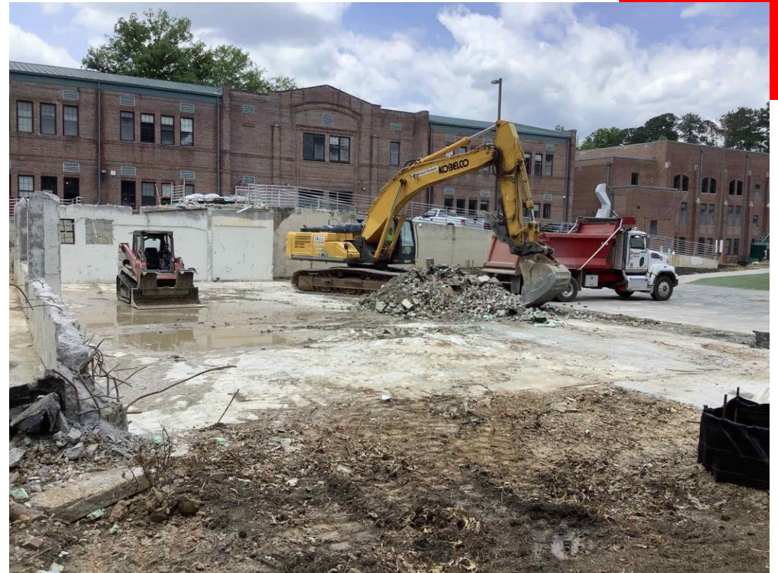
Existing gym building demolition